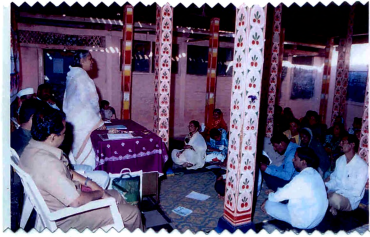
Impact Of Central Rural Sanitation Programmes on Kavathepiran Village in Sangli District