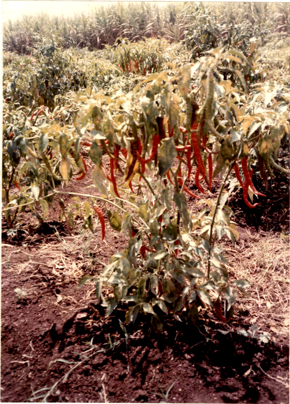
CAPSICUM ANNUUM HYBRID VARIETY (chilli)