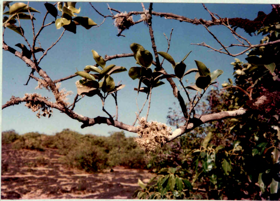
Usnea ghattensis with Apothechia