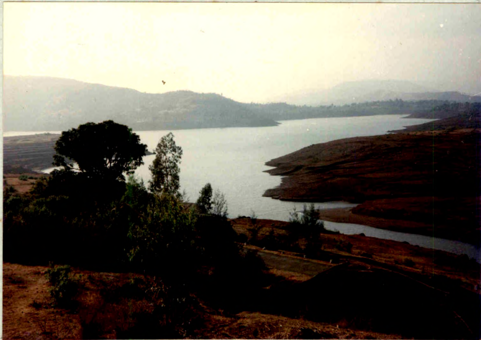
Hill top flora of Bamnoli