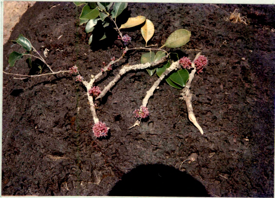
Anaptychia diademata Parmelina wallichiana