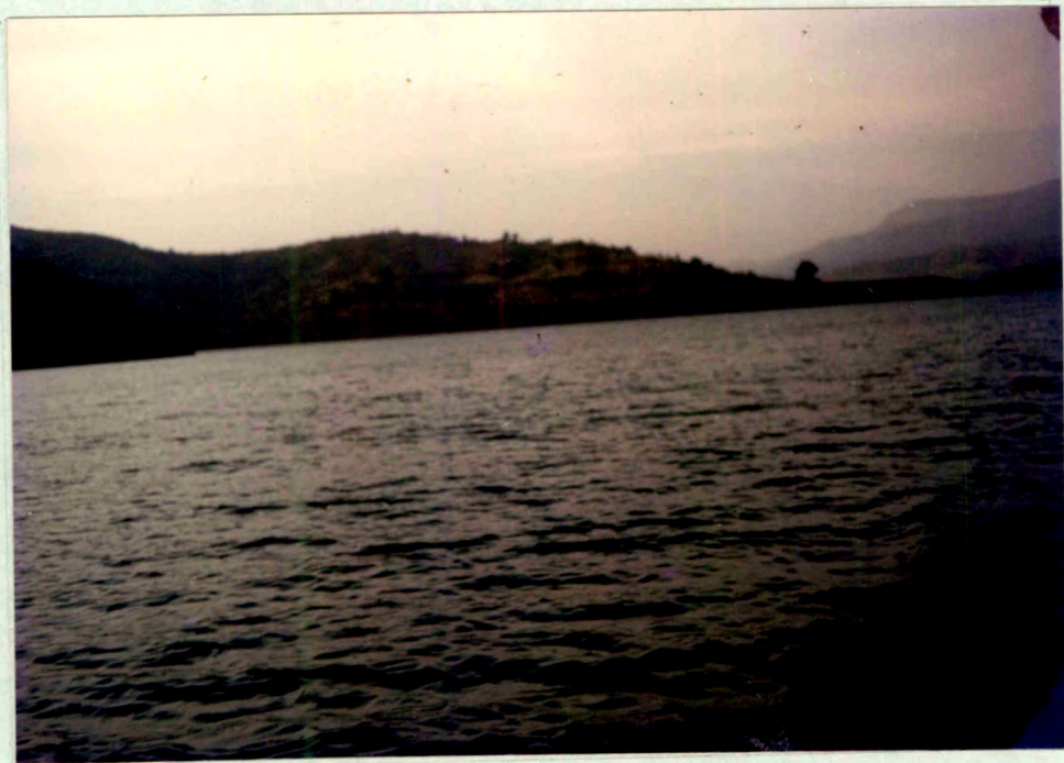
b. Hills around Kas lake