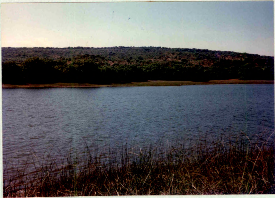
a. 'Kas lake' ( Sahyadri Forest )