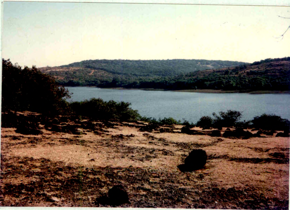
Natural view of Kas lake