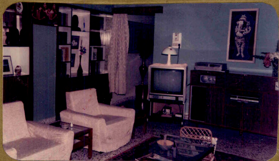
Impact of Foreign Contacts on Home Decoration