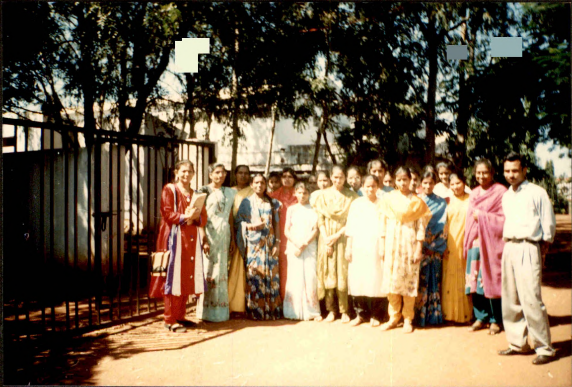
Building of COSMOS Watch Factory Ltd. Some of the women workers and Researcher