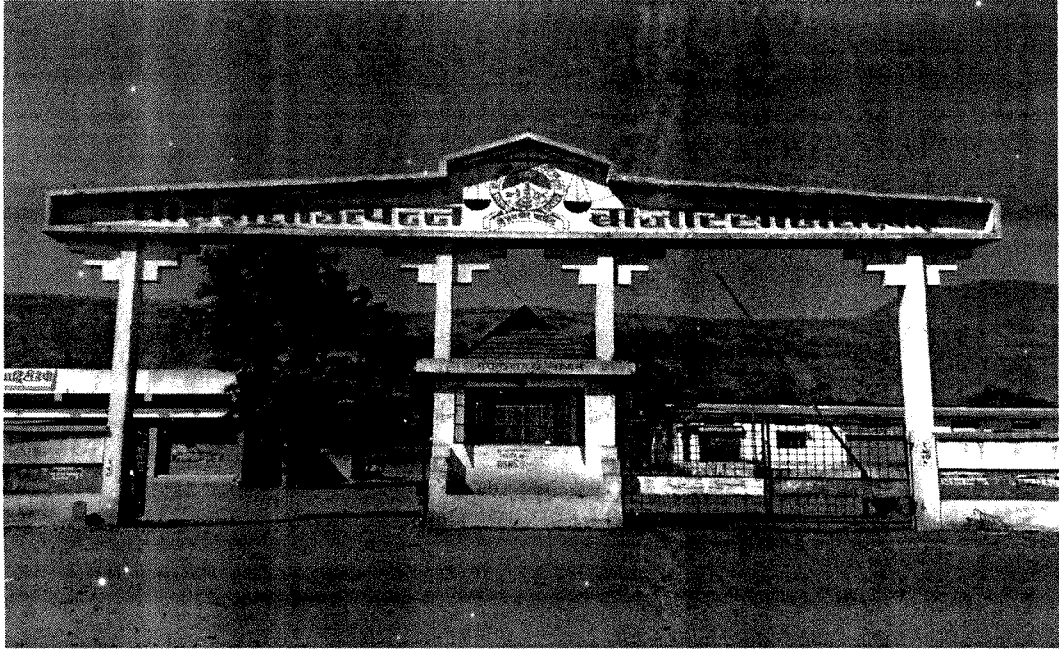
Krushi Utpanna Bazar Samittee, Wai, District – Satara