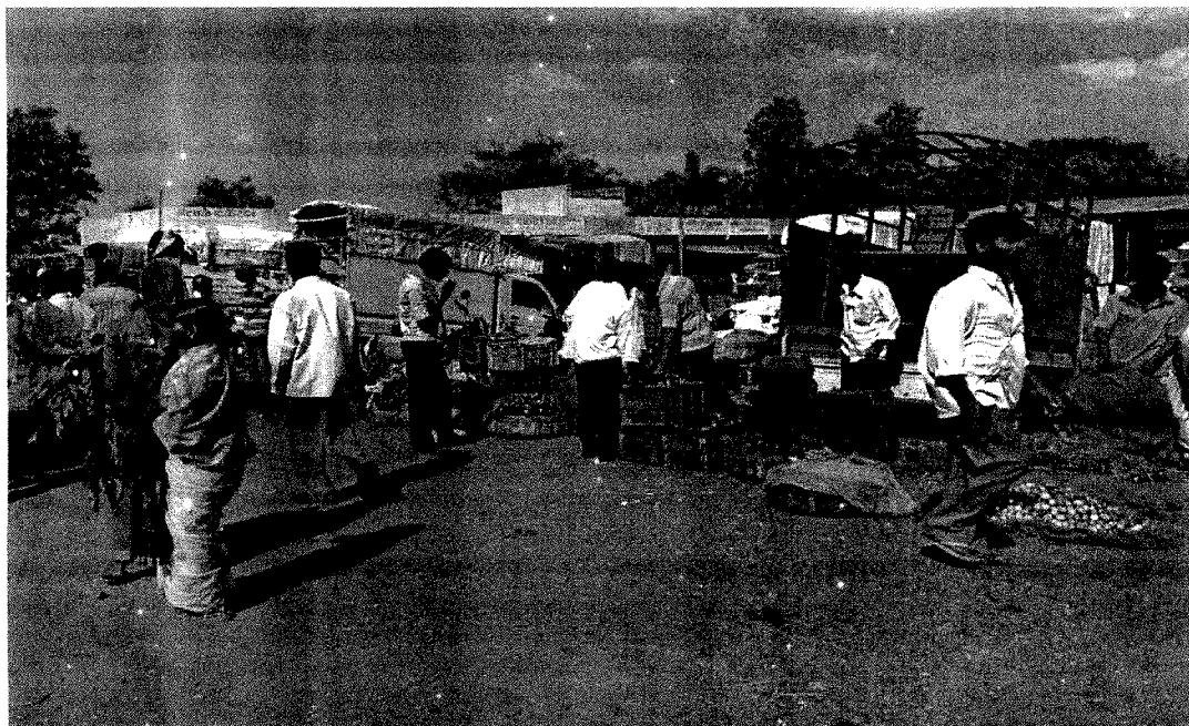
Principal Market Yard