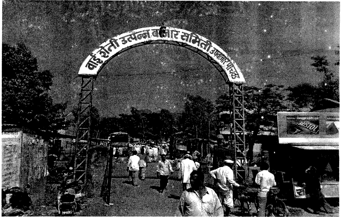
Sub Market Yard, at Panchwad, Tal. Wai.