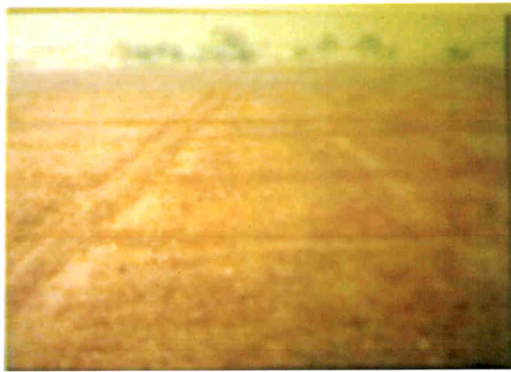
Method of Dry land-Bunding