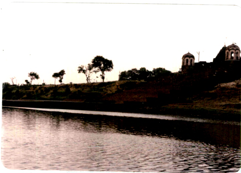
PLATE NO. 4