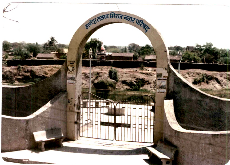
PLATE NO. 3