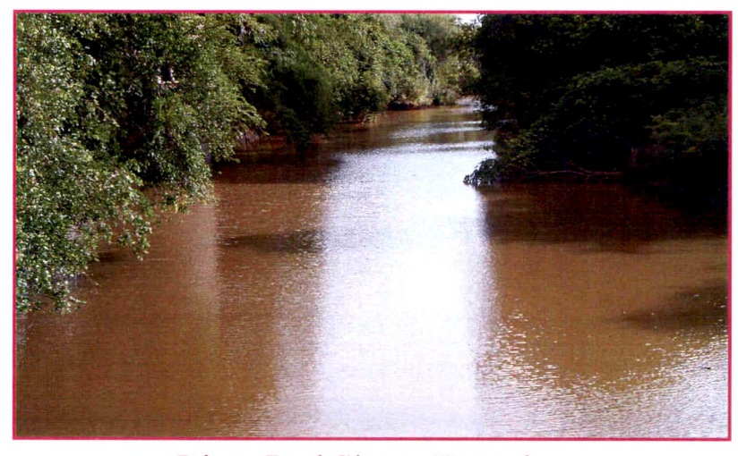
River Bed Site at Kapasi