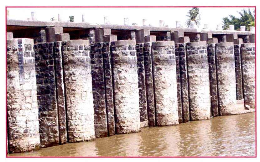
K. T. Weir at Village Nandyal