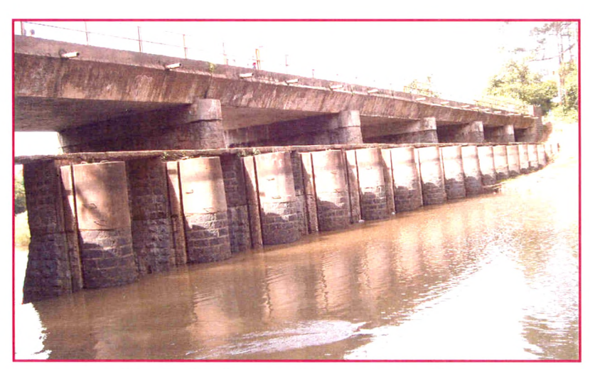
K. T. Weir at Village Kapasi