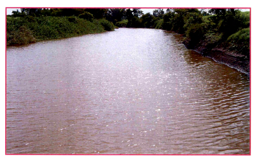
River Bed Site at Arjunwada