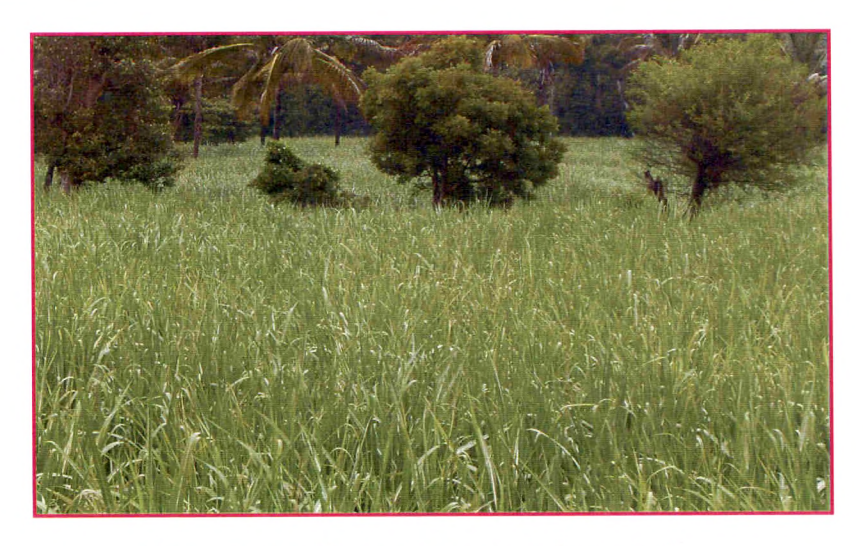
Sugarcane Cropping at Arjunwada