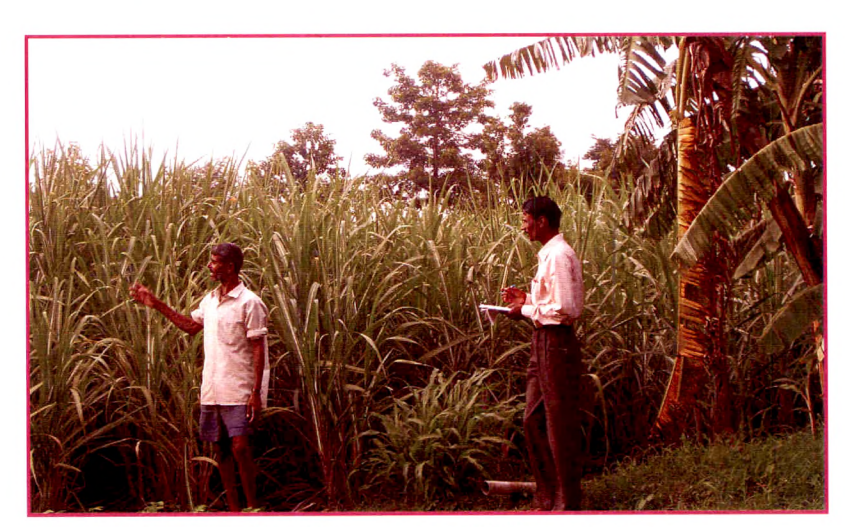
Plot to Plot Survey at Village Metage