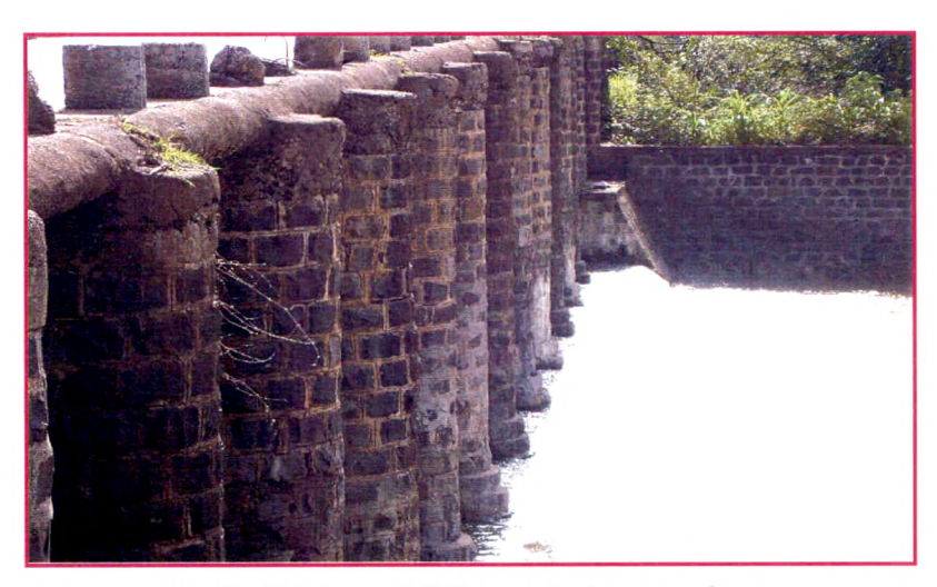
K. T. Weir at Village Arjunwada