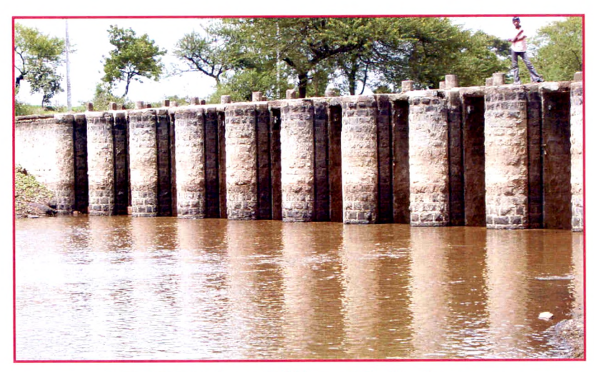
K. T. Weir at Village Galgale