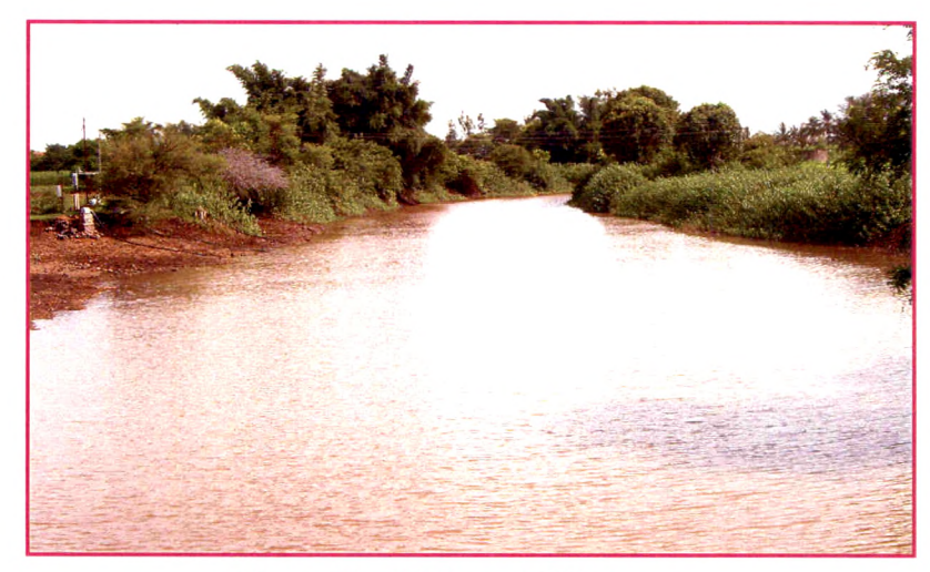
River Bed Site at Metage