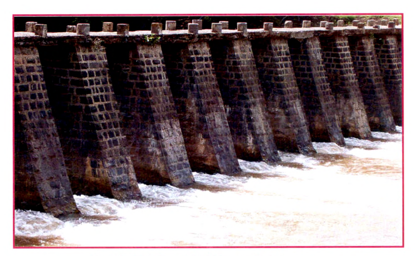
K. T. Weir at Village Metage