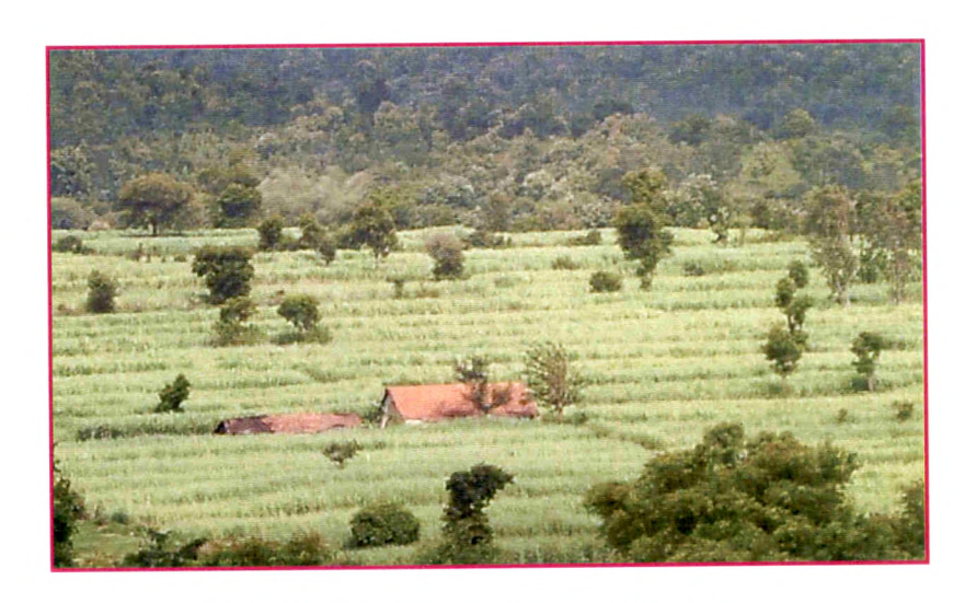
Sugarcane Cropping at Kapsi