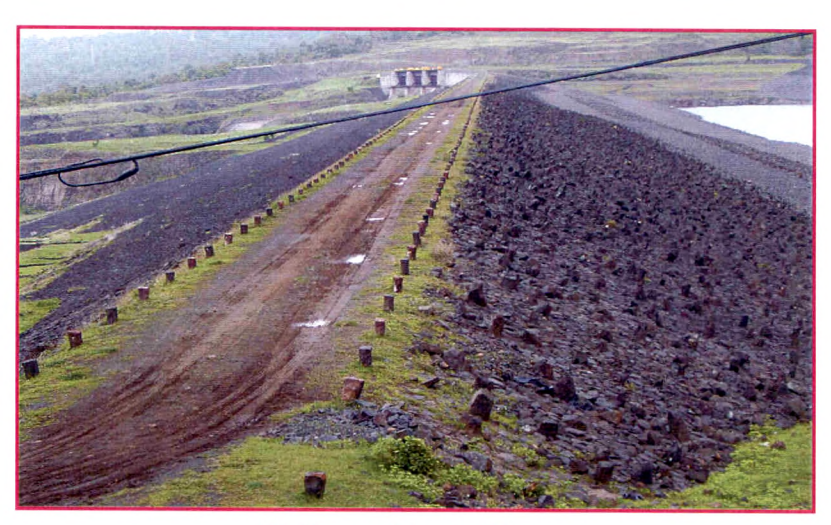
Chikora Dam Site