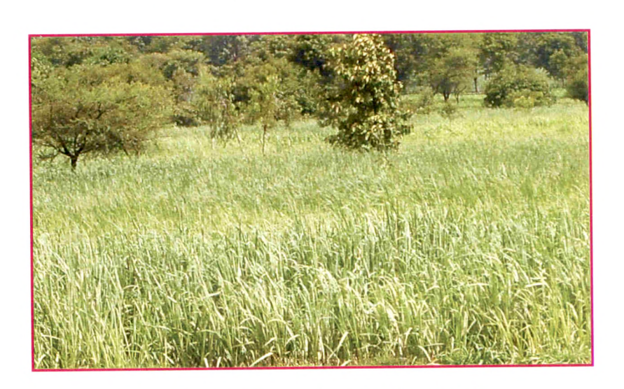
Sugarcane Cropping at Nandyal