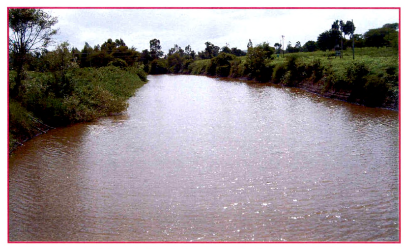
River Bed Site at Galgale