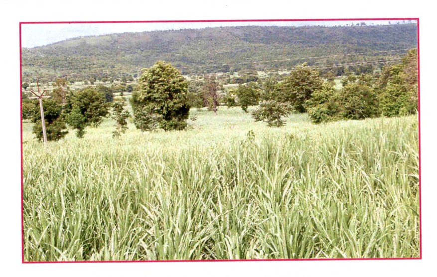
Sugarcane Cropping at Metage