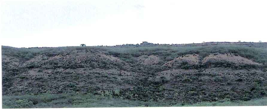
K. Collection site of Charophytes: Panhala Fort