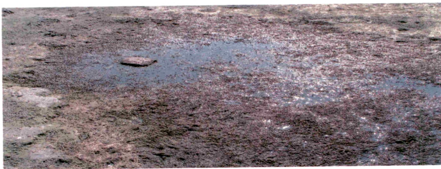
L. Collection site of Charophytes: Rashiwde