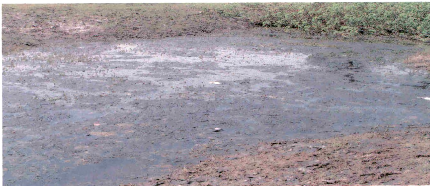
G. Collection site of Charophytes: Rajaram Lake, Kolhapur