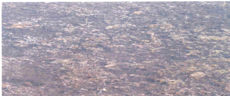
D. Collection site of Charophytes: Jaisingh Lake, Kagal