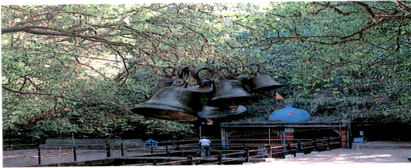
A1. Origin of Hiranyakeshi River: Amboli