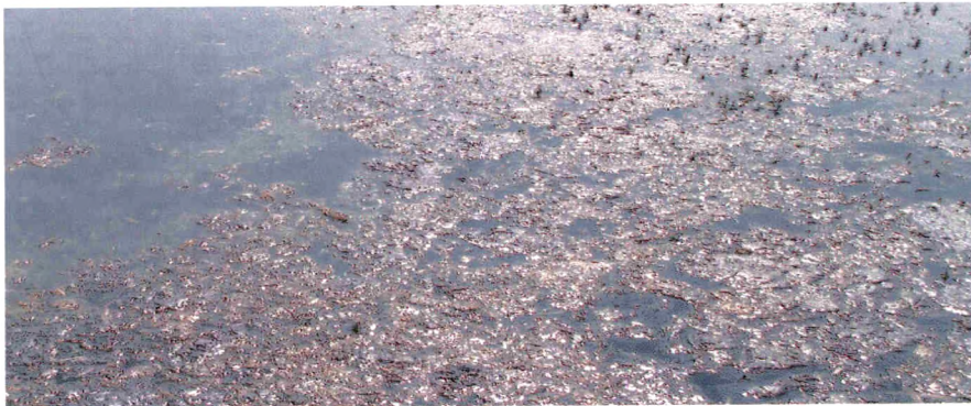
I. Collection site of Charophytes: Malkapur