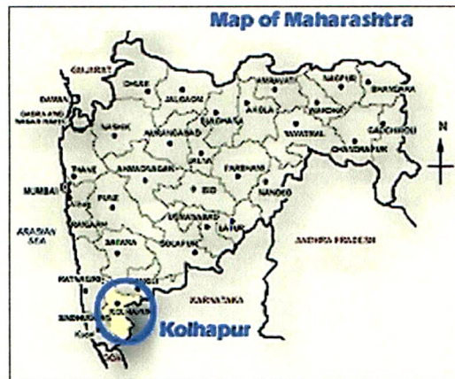
Map of Maharashtra with Kolhapur district inset