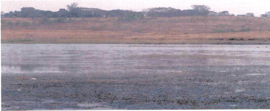
H. Collection site of Charophytes: Rajaram Lake, Kolhapur