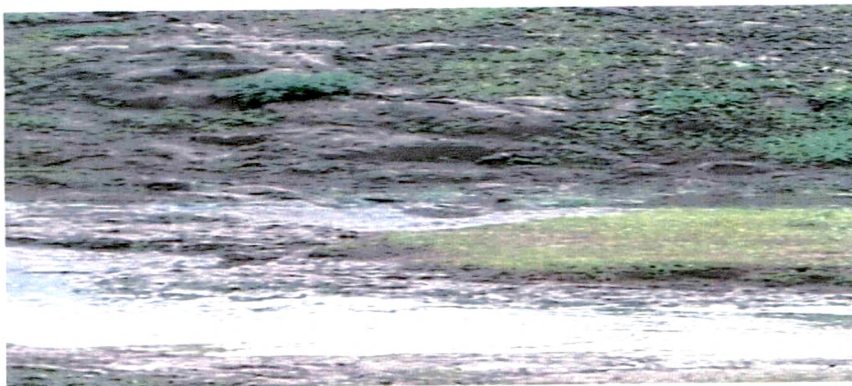
A3. Collection site of Charophytes: Amboli