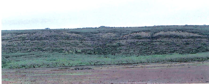
J. Collection site of Charophyte: Panhala Fort