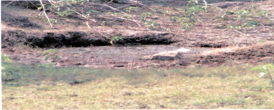
B. Collection site of Charophytes: Gadhinglaj