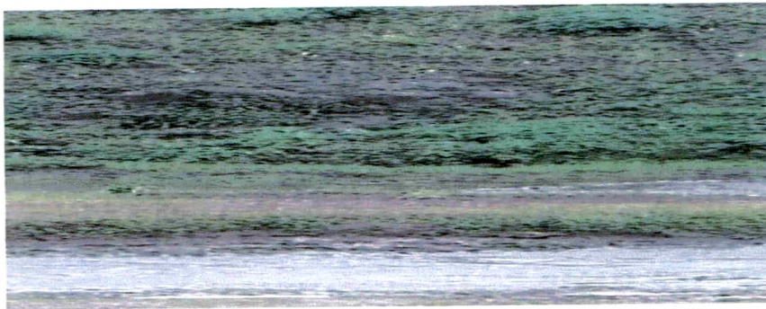
A2. Collection site of Charophytes: Amboli