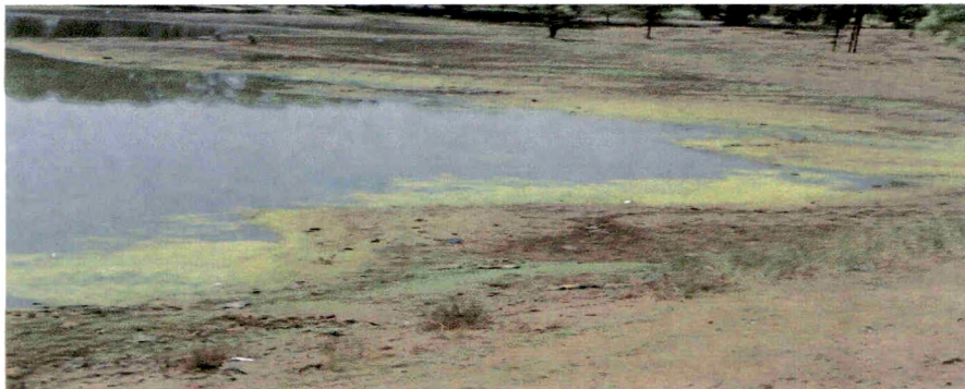
F. Collection site of Charophytes: Kalamba Lake, Kolhapur