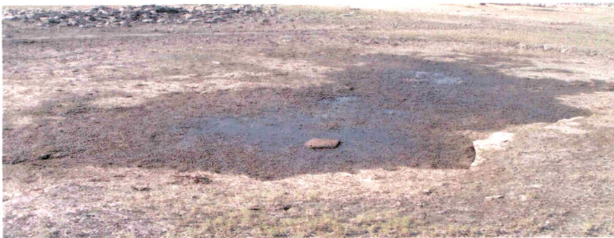
C. Collection site of Charophytes: Ichalkaranji