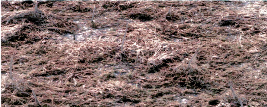
E. Collection site of Charophytes: Kurundwad