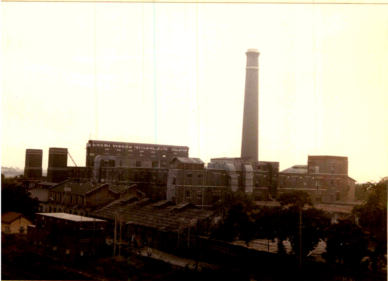
LAXMI-VISHNU MILLS, SOLAPUR.