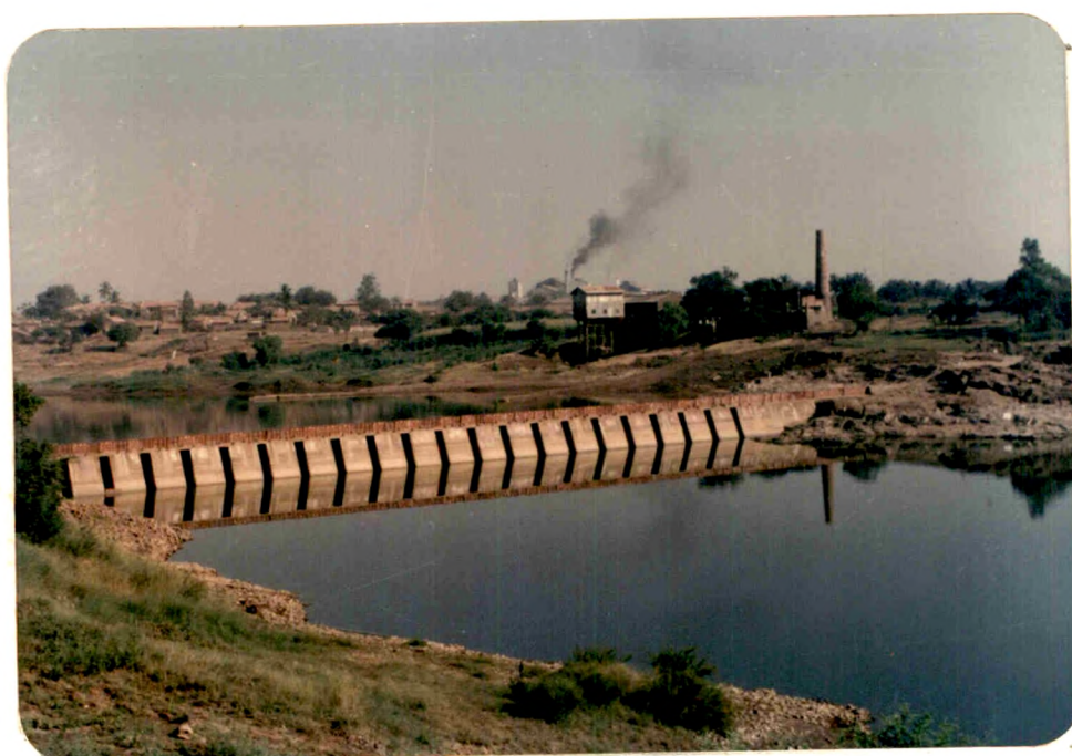
"UGAR DAM ACROSS KRISHNA RIVER AND THE UGAR SUGAR WORKS."